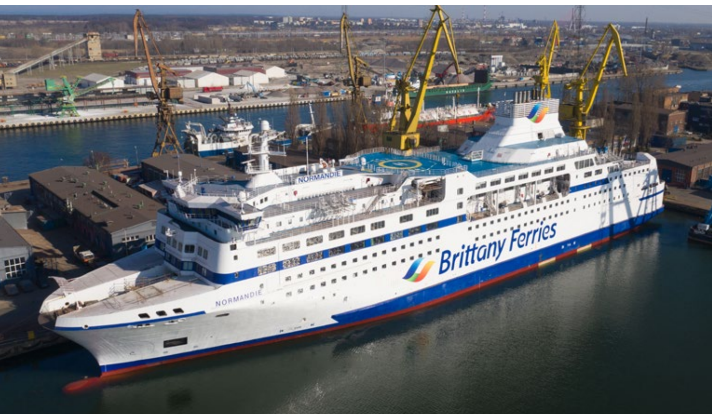
In 2022 the Normandie was retrofitted with a BWT System at Remontowa